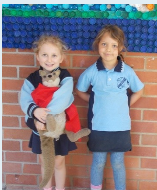
GARBY CLASS KJ