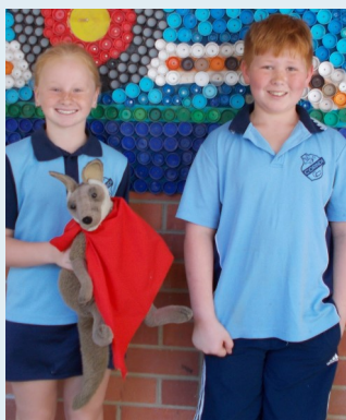
GARBY CLASS 5/6 E