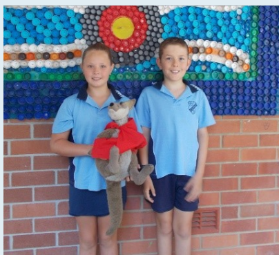
GARBY CLASS 3/4 Q