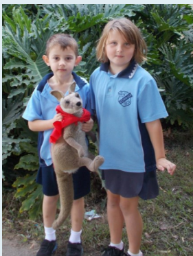
GARBY CLASS K W