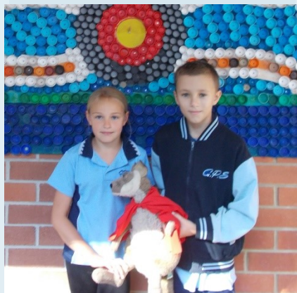
GARBY CLASS 5/6D