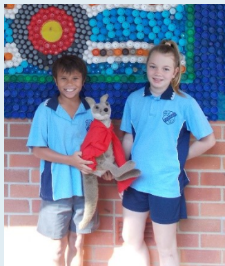
GARBY CLASS 3/4 Q