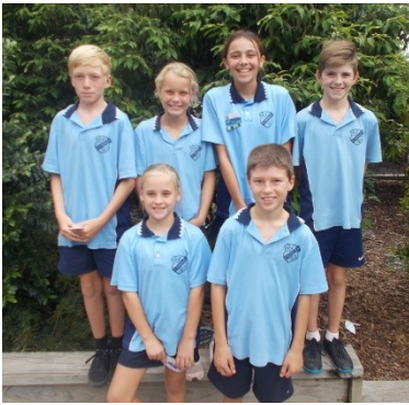
Swimming Carnival age champions