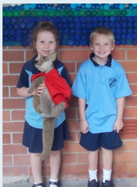
GARBY CLASS KP