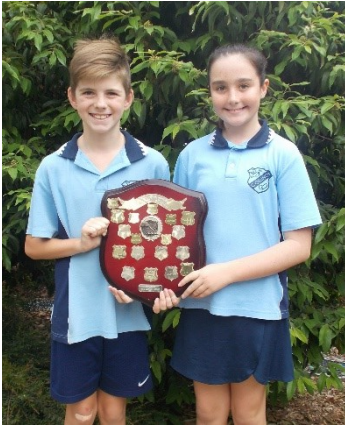
DOLPHINS Winning house of the 2020 Swimming Carnival