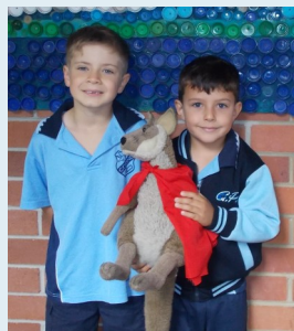
GARBY CLASS 1/2E