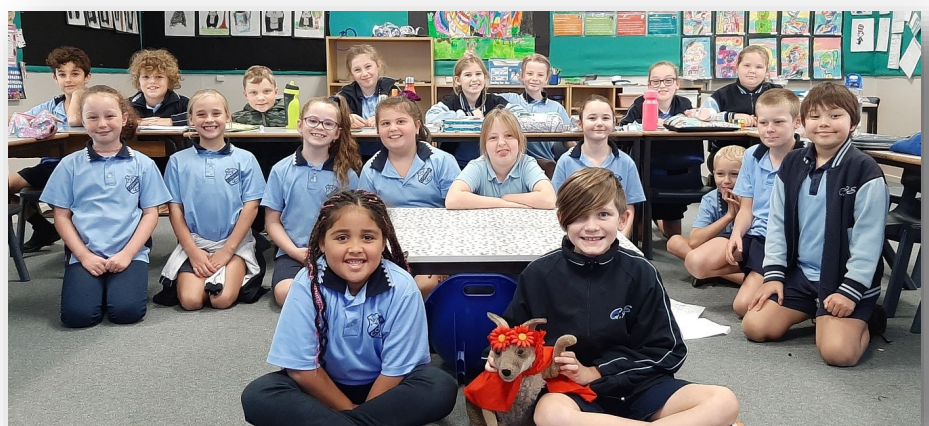
GARBY CLASS 3/4 Q

Find us on the web... www.corindi-ps.school.nsw.edu.au Facebook SkoolBag