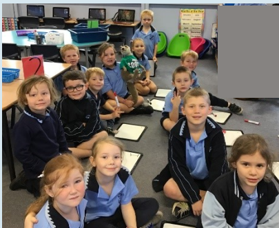
GARBY CLASS KP

Photo Day - Thurs July 30 Sibling envelopes available from the office