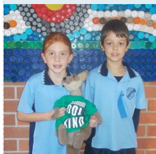
GARBAGE CLASS 1/2 B

Please hand in your photo envelope to the office by Thursday. Sibling envelopes available. If paying by cash please ensure correct money as the order envelopes are processed by the photography company, not by the school.