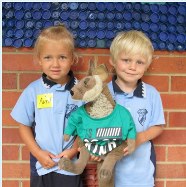
GARBY CLASS KOALA