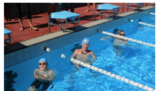
Swimming Carnival Competitors